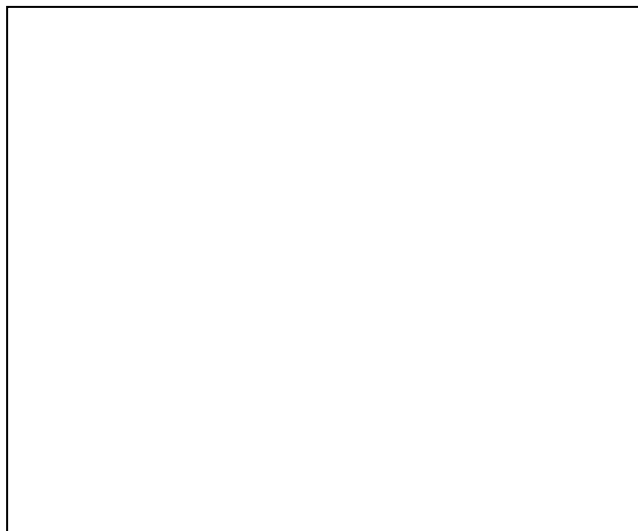
FIG.: 1 column, maximal width (at ratio 255 x, 210 y)